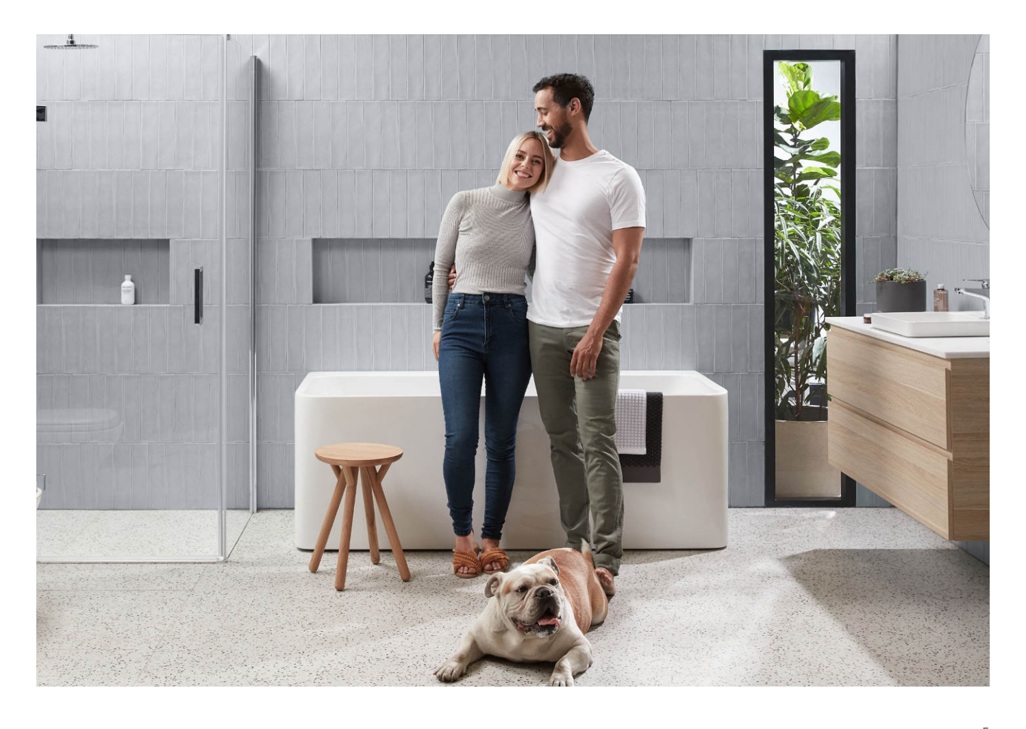
Disclaimer: All items in the K-Living inclusions are subject to change and are valid from 1st October 2021, and are subject to specific design chosen. All images contained 5 within this document are for illustration purposes only and are not included in the K-Living Inclusions.